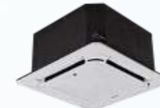
Mini-Cassette Series 2