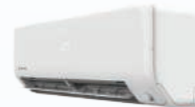
Serene Series 2 Wall Hung Split