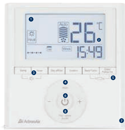
Optional wired wall controller

For those who like a little more control, or who just keep losing the remote, MultiElite can also use a wall mounted wired controller that delivers precise temperature control.